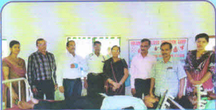
Blood Donation Camp Organised by N.M.V. Rupsa

(Signature) N.M.V. Mahavidyalaya Rupsa, Balasore